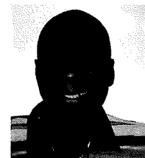
Nyame Nhyira Mo (May God bless you all).