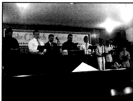
YIA brothers in Erie, Pennsylvania Branch

Several years ago our Mission decided to begin connecting with to our local community in order to share the love of Jesus Christ. Our goal: to give expecting nothing in return. Thus began the first of many free clothing giveaways. During our first outreach, the Lord confirmed His delight. Three times during the day a brother walked into the sanctuary for a respite. Each time the Spirit filled him to tears. The third time, the Spirit spoke, "For I was an hungered, and ye gave me meat: I was thirsty, and ye gave me drink: I was a stranger, and ye took me in: Naked, and ye clothed me: I was sick, and ye visited me: I was in prison, and ye came unto me... Verily I say unto you, Inasmuch as ye have done it unto one of the least of these my brethren, ye have done it unto me" (Matthew 25:35-40). Never could we imagine what was about to unfold to this small handful of saints.