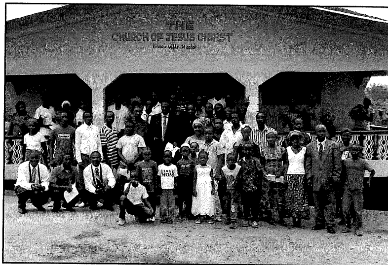
New Church building in Liberia