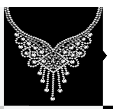
HAPPY MOTHER"S DAY SUNDAY, MAY 14th.

Her children arise up, and call her blessed; her husband also, and he praiseth her. Psalm 31:28