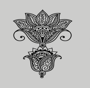
APRIL A Beatitude Bouquet: Matthew 5:4

Blessed are they that mourn: for they shall be comforted.