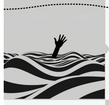
MARCH When the waves of death compassed me... ...In my distress I called upon the Lord,... and he did hear my voice out of the temple, and my cry did enter into his ears. 2 Sam 22:5,7