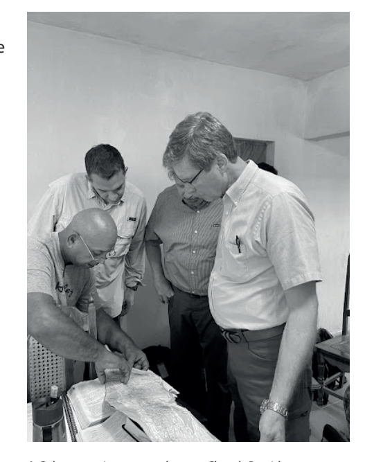
A Cuban map is presented to our Church President Las Tunas, Cuba