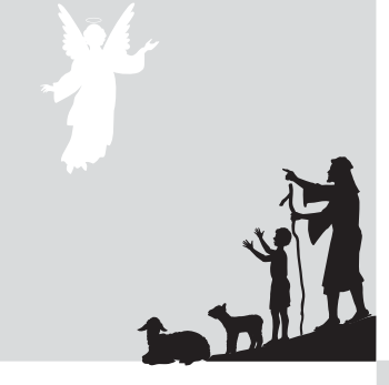
And, lo, the angel of the Lord came upon them and the glory of the Lord shone round about them. Luke 2:9