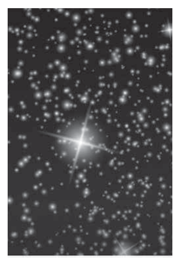
(Continued on page 11)

As children we learn the song "Twinkle, Twinkle Little Star. "One line says 'like a diamond in the sky. To the